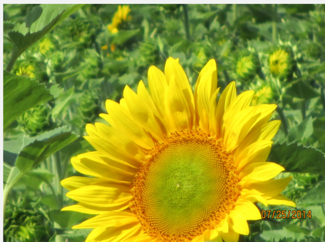
Processed sunflower seeds make sunflower oil